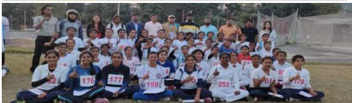
STATE RD CAMP