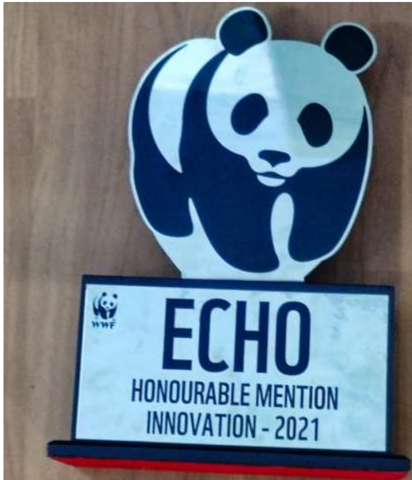
MEMENTO AWARDED BY WWF