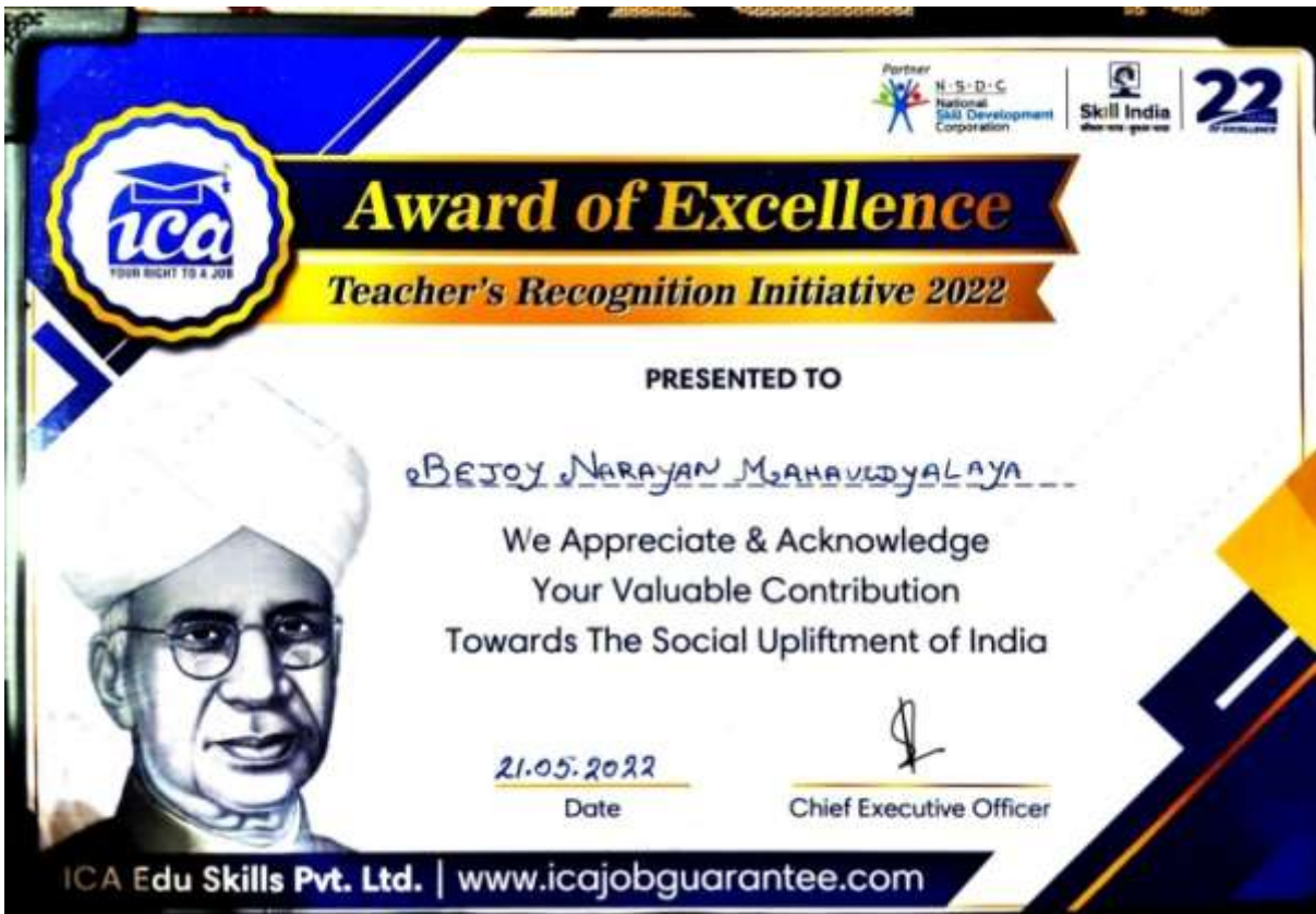
AWARD OF EXCELLENCE BY ICA EDU SKILLS PVT. LTD.