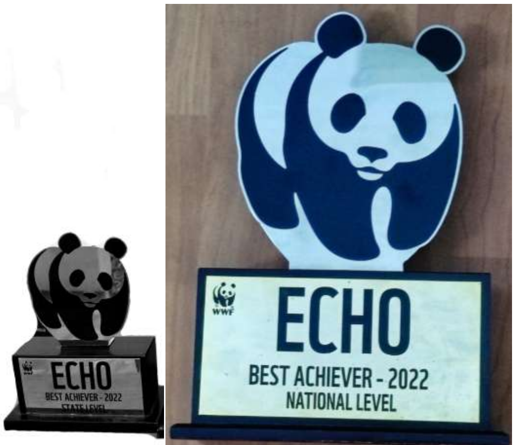
BEST ACHIEVER AT STATE LEVEL AND NATIONAL LEVEL BY WWF