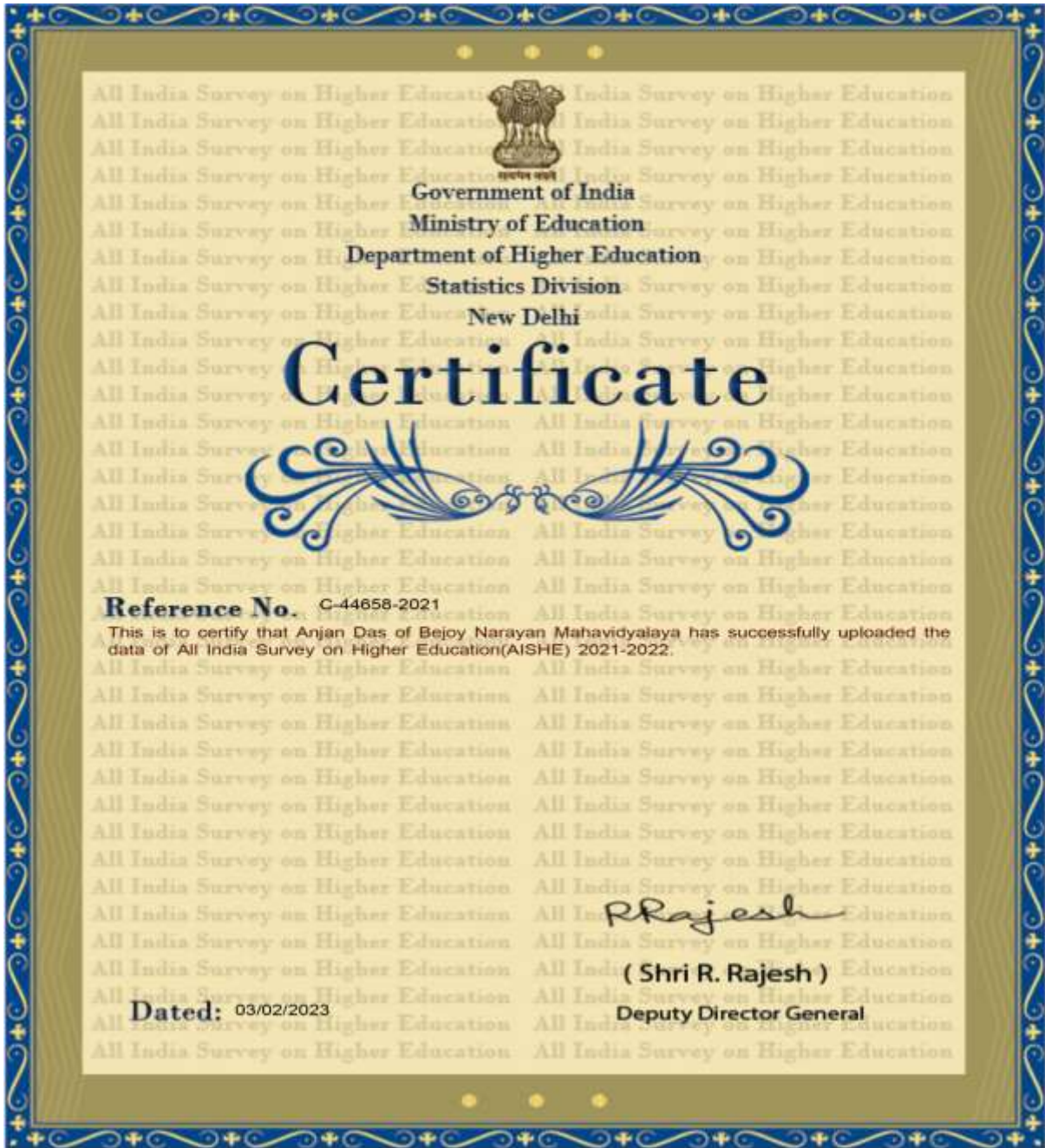
Certificate by the DEPARTMENT OF HIGHER EDUCATION, STATISTICS DIVISION, MINISTRY OF EDUCATION, GOVERNMENT OF INDIA for successfully UPLOADING THE DATA OF ALL INDIA SURVEY ON HIGHER EDUCATION (AISHE) 2021 – 2022