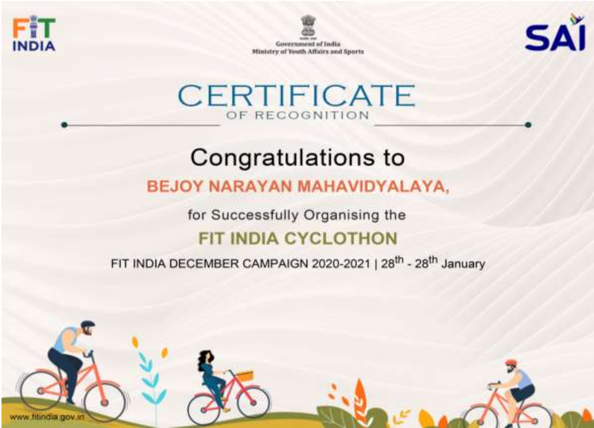
Certificate of Recognition by The Ministry of Affairs and Sports, The Govt. Of India for Fit India December Campaign 2020-2021