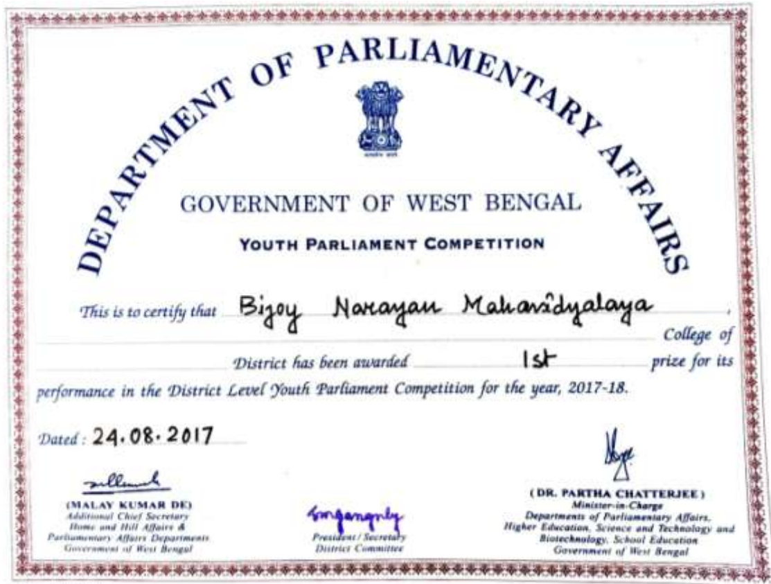
CERTIFICATE OF CHAMPIONSHIP IN YOUTH PARLIAMENT COMPETITION