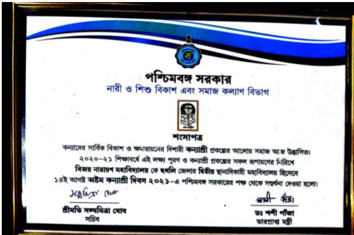
2 ND POSITION IN KANYASHREE PRAKALPA FOR THE YEAR 2020-21