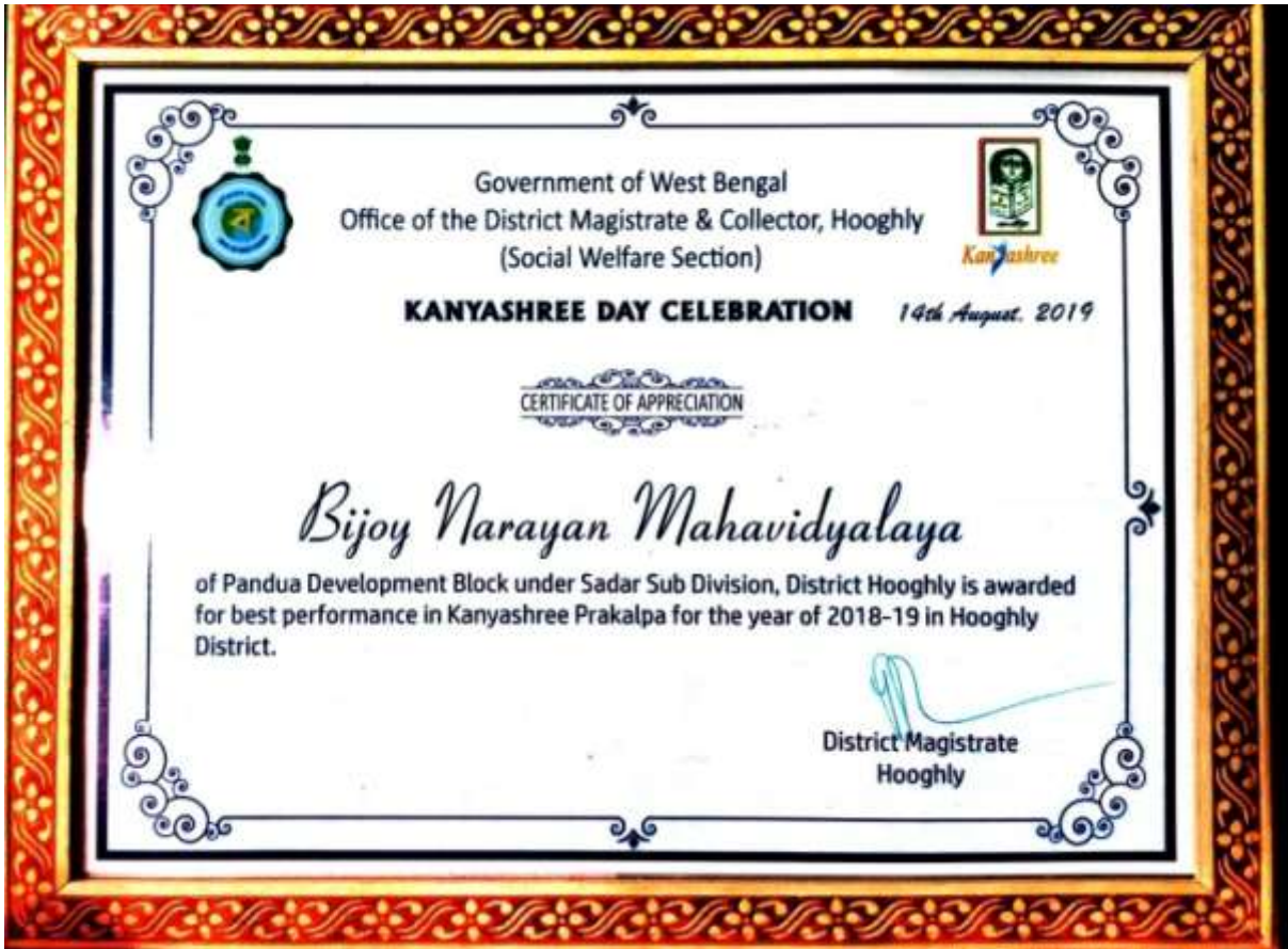
BEST PERFORMANCE IN KANYASHREE PRAKALPA FOR THE YEAR 2018-19